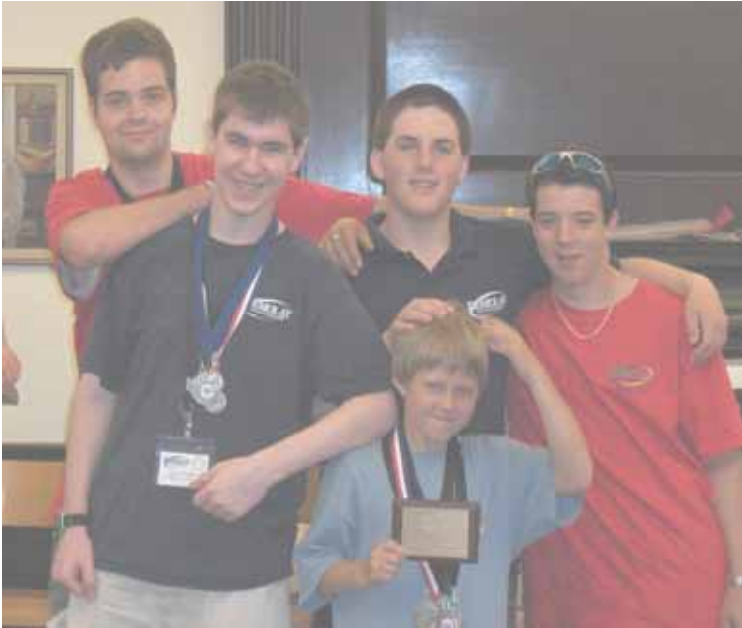
Members of Phil Drader shared the Best Chapter award. Can teamwork be this much fun?

There were many individual awards, but for the most part, our summary will focus on team awards