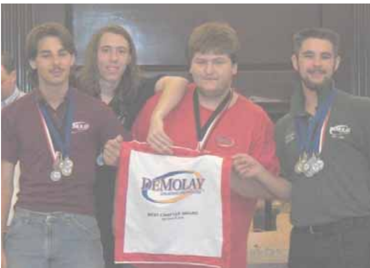
Capital City members hold their second place banner.